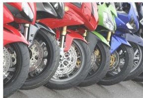
Theme 1 – Road User Awareness

A motorcycle safety and transport policy framework