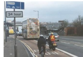
Theme 6 – Partnership with Cycling