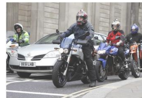
Theme 3 – Motorcycles as a Practical Solution