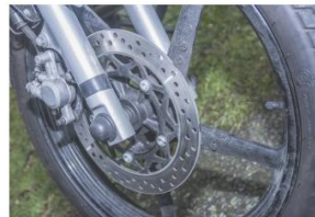
Theme 5 – Better Motorcycle Industry Engagement in Society