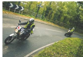
Theme 2 – Educate to Deliver