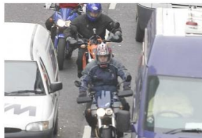
Theme 4 – Unlocking the Benefits of Motorcycling